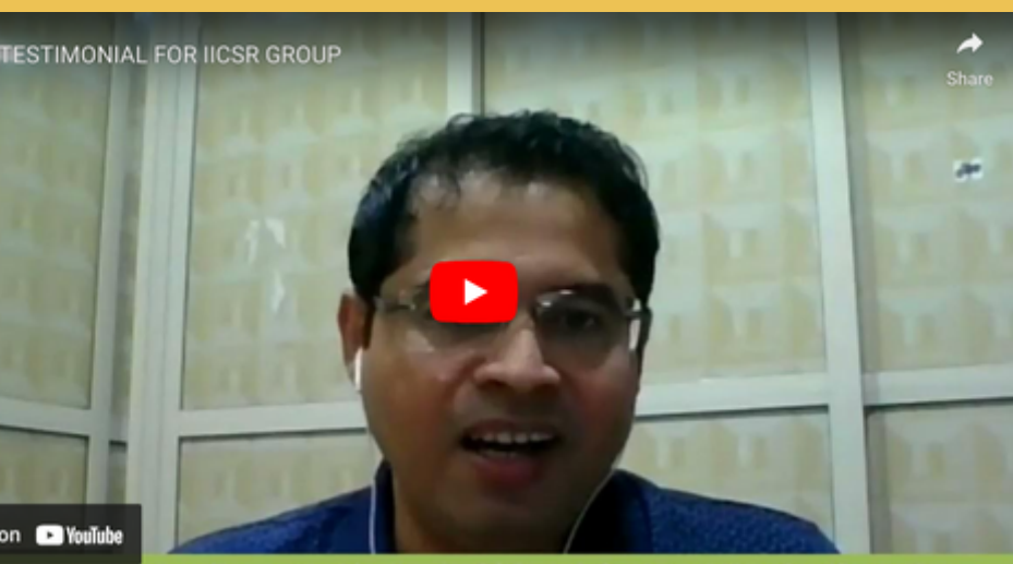
Masters in CSR and Sustainability