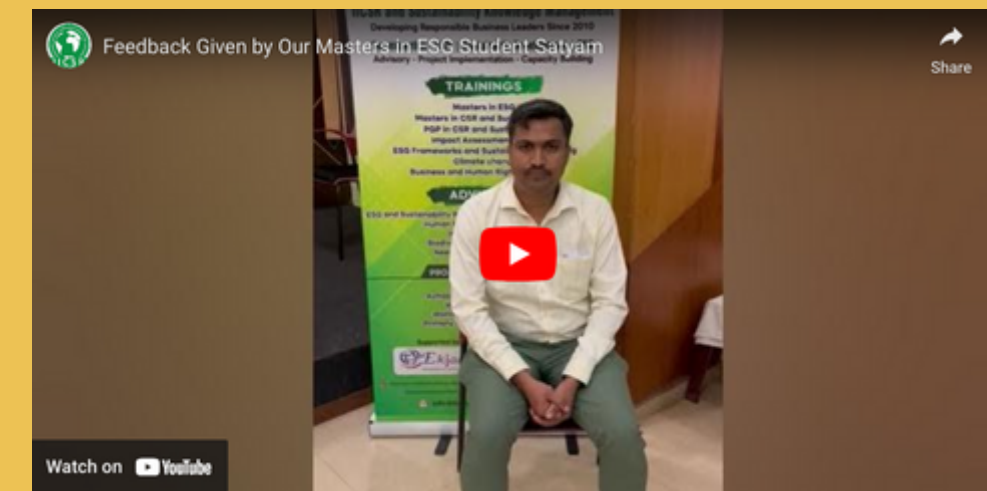
Our Masters in ESG