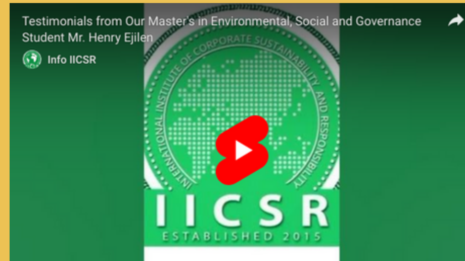
Testimonials from Our Master's