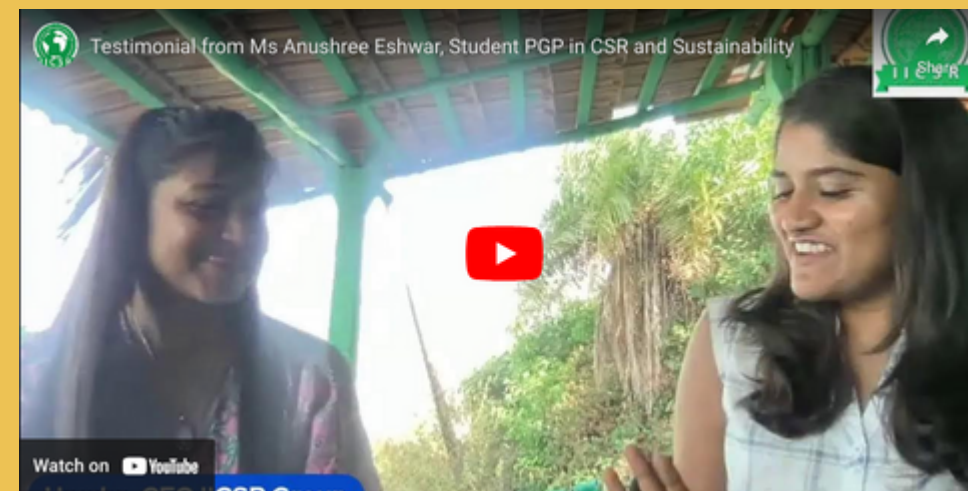
PGP in CSR and Sustainability