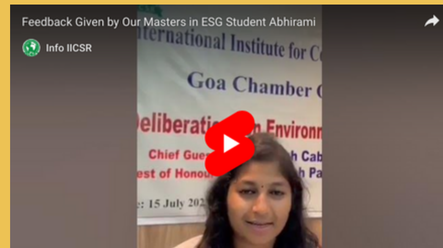
Masters in ESG