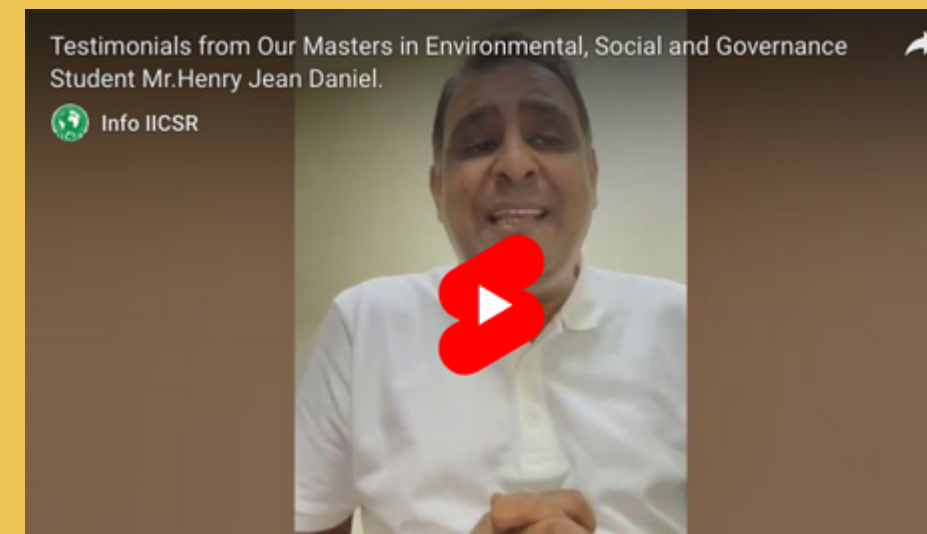
Testimonials from Our Masters in Environmental, Social and Governance