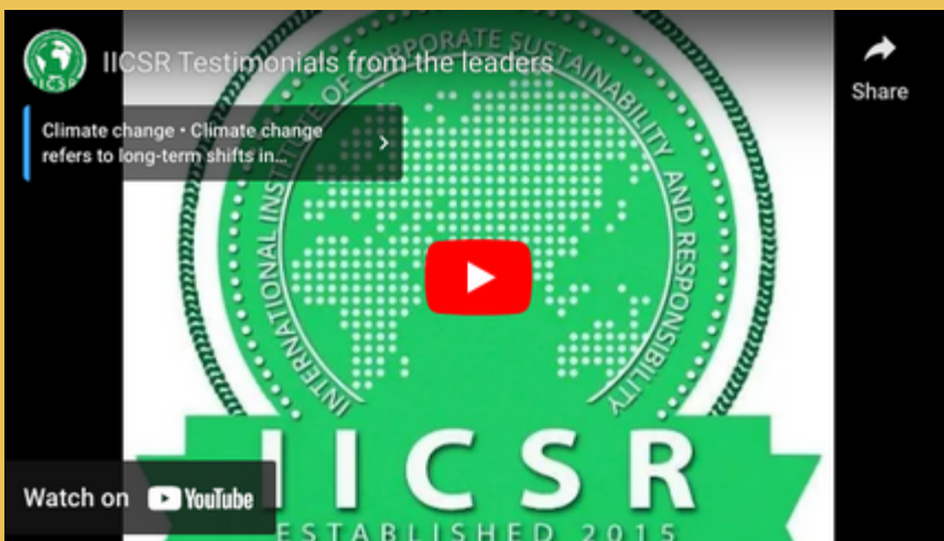
Faculty and Advisors