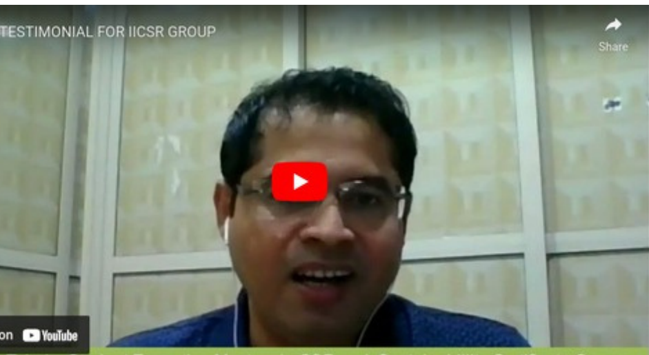
Masters in CSR and Sustainability