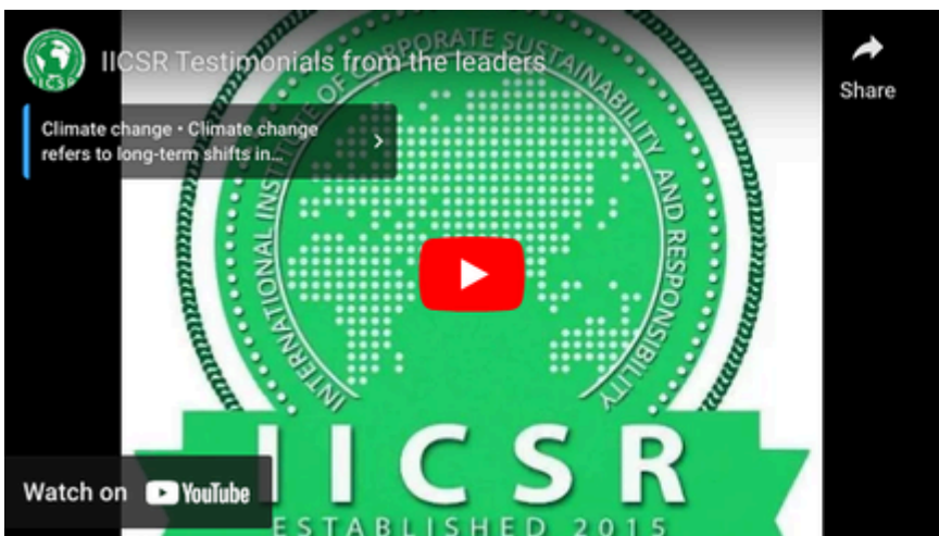
Faculty and Advisors