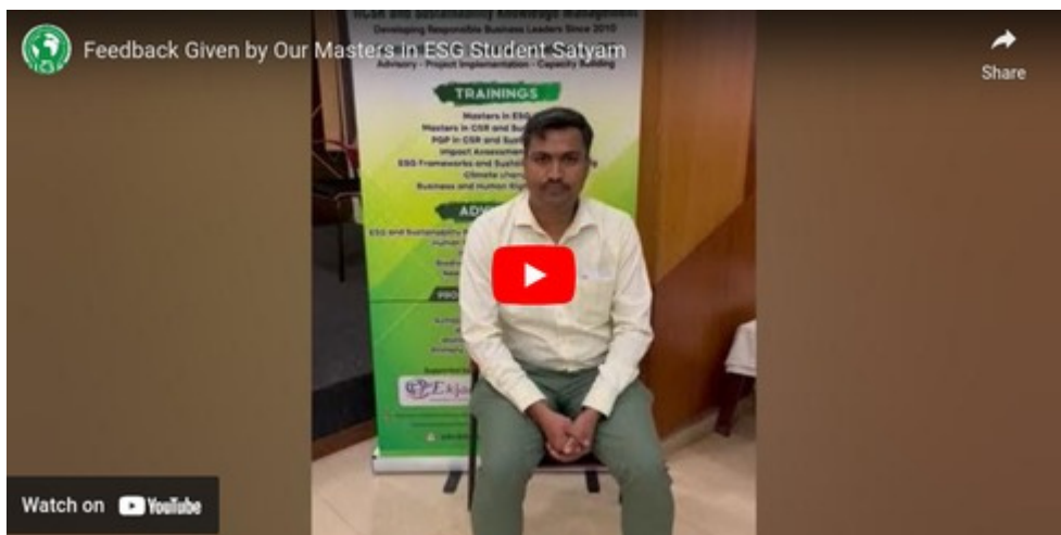
Our Masters in ESG