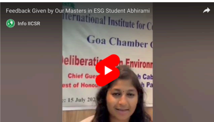
Masters in ESG