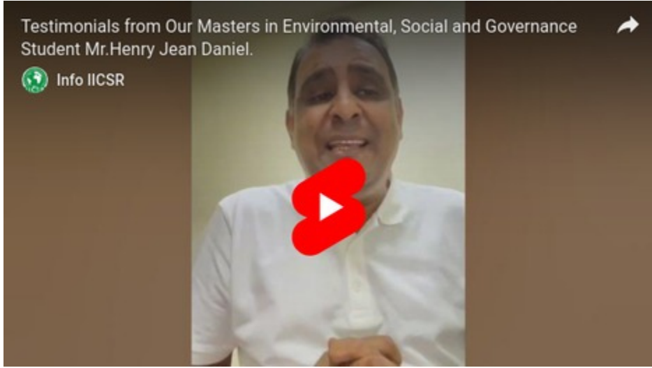
Testimonials from Our Masters in Environmental, Social and Governance