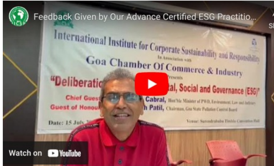
Our Advance Certified ESG Practitioner