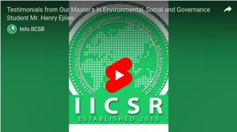
Testimonials from Our Master's