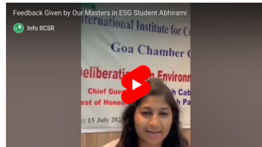
Masters in ESG