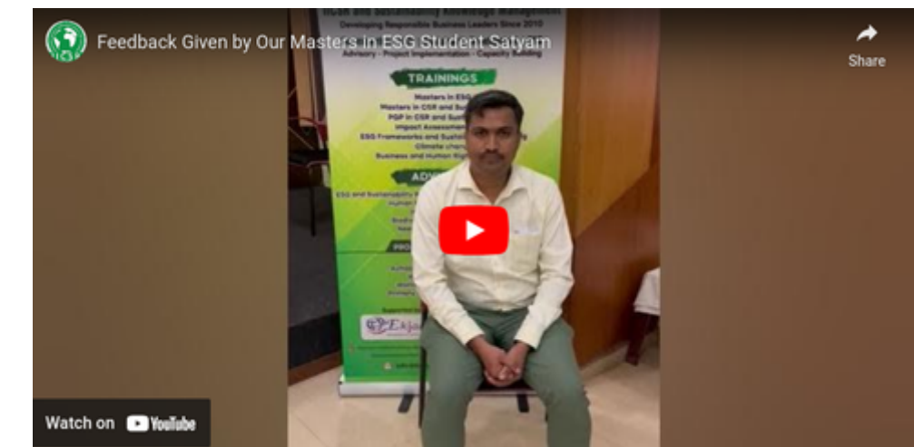
Our Masters in ESG