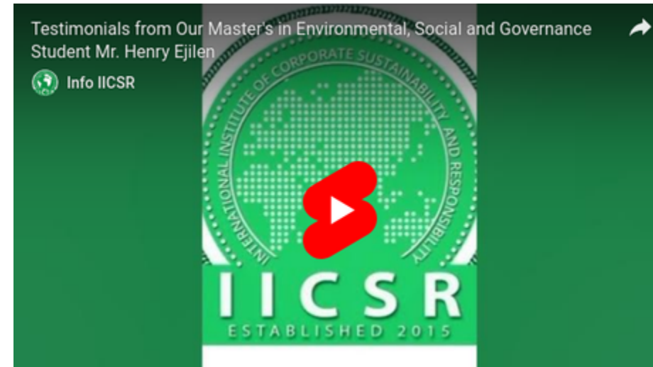
Testimonials from Our Master's