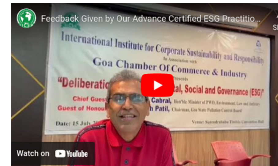
Our Advance Certified ESG Practitioner