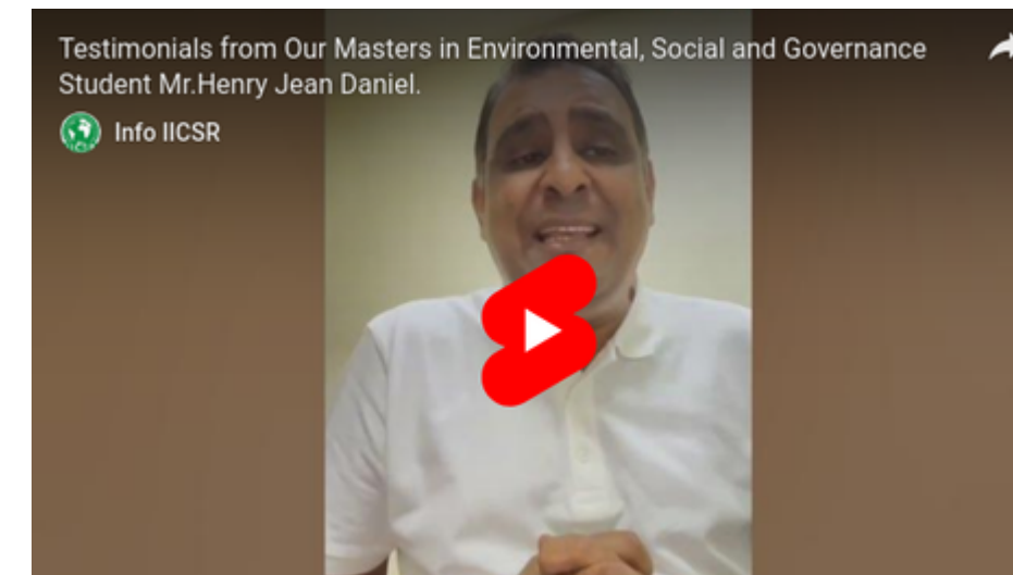
Testimonials from Our Masters in Environmental, Social and Governance