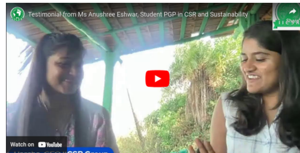
PGP in CSR and Sustainability