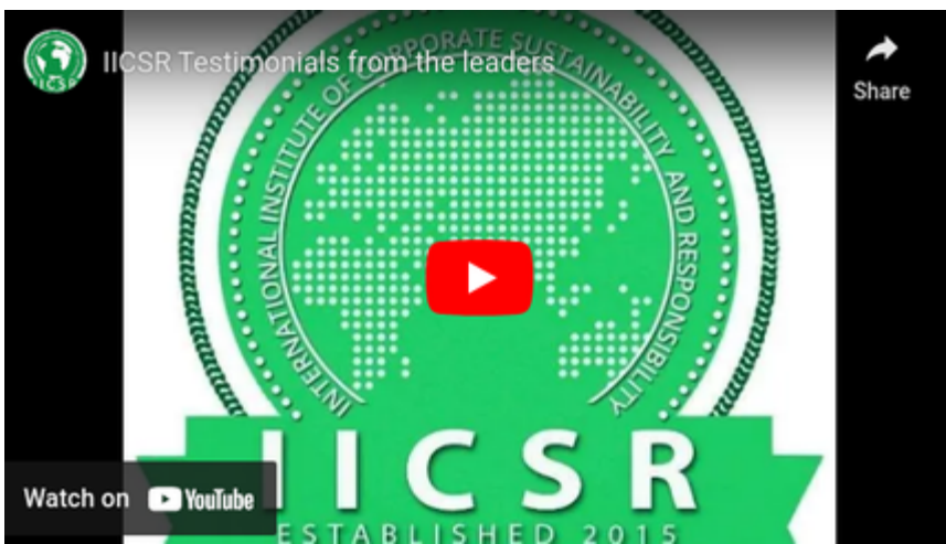
Faculty and Advisors