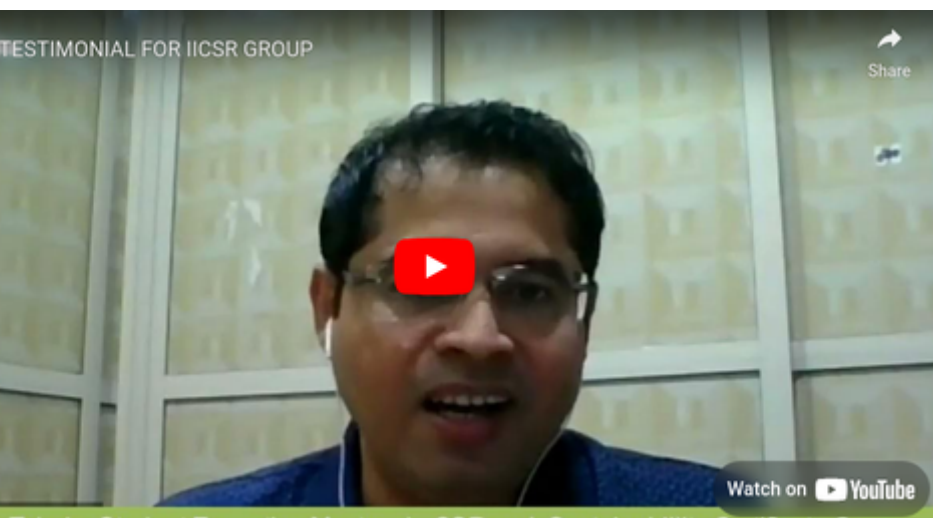
Masters in CSR and Sustainability